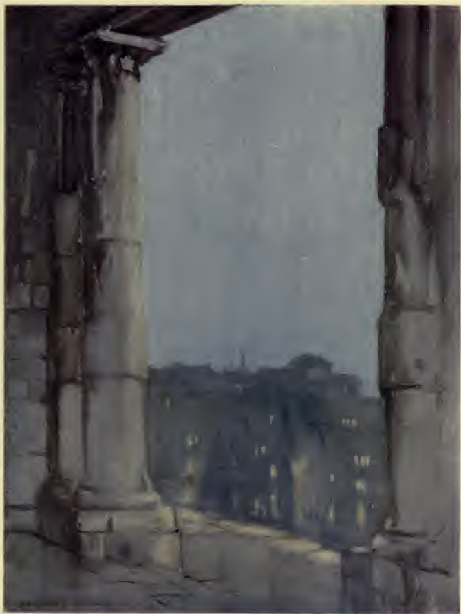
FROM THE DOGANA AT NIGHT