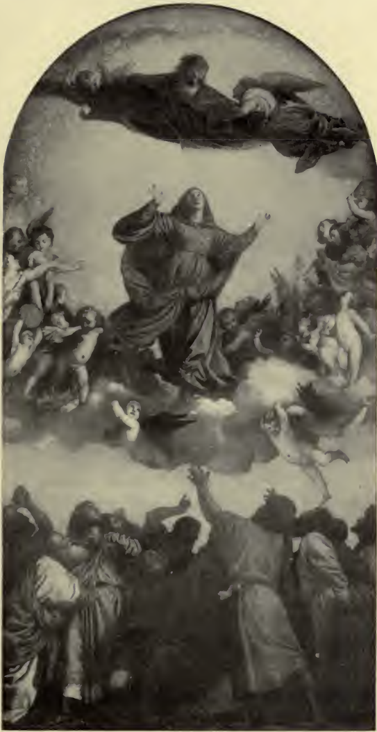
THE ASSUMPTION OF THE VIRGIN FROM THE PAINTING BY TITIAN In the Accademia