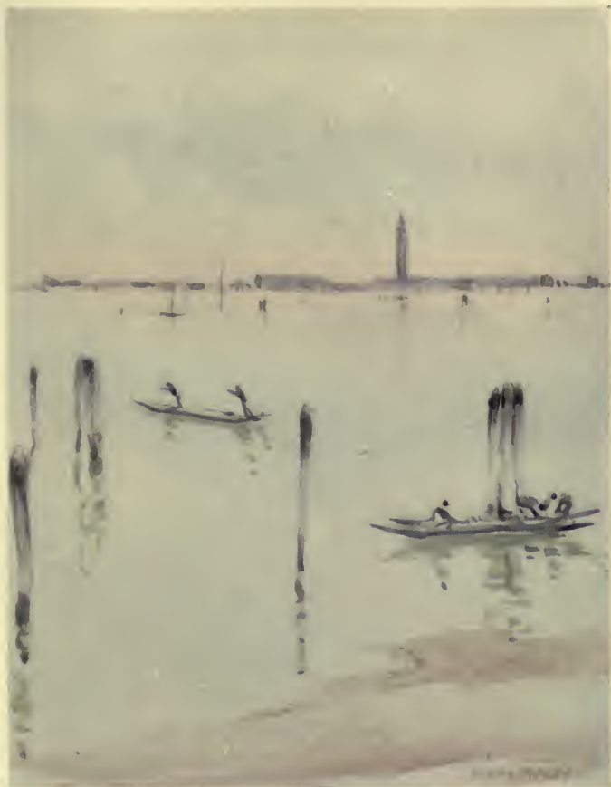
THE ARMENIAN MONASTERY AND THE LAGOON