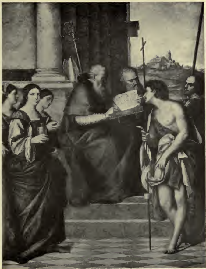
S. JOHN CHRYSOSTOM WITH SAINTS FROM THE PAINTING BY PIOMBO In the Church of S. Giov. Crisostomo