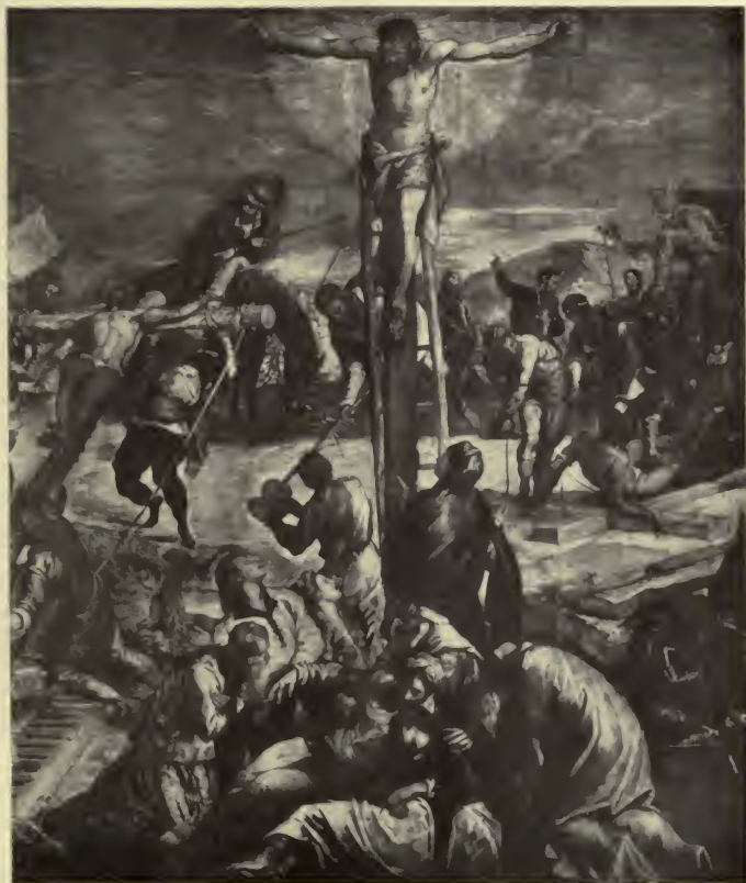
THE CRUCIFIXION (CENTRAL DETAIL.) FROM THE PAINTING BY TINTORETTO In the Scuola di S. Rocco