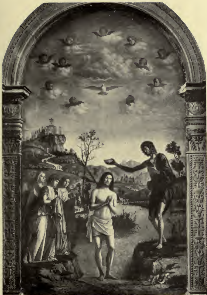
THE BAPTISM OF CHRIST FROM THE PAINTING BY CIMA In the Church of S. Giovanni in Bragora