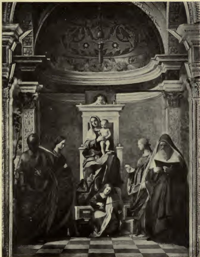
MADONNA AND CHILD WITH SAINTS FROM THE PAINTING BY GIOVANNI BELLINI In the Church of S. Zaccaria