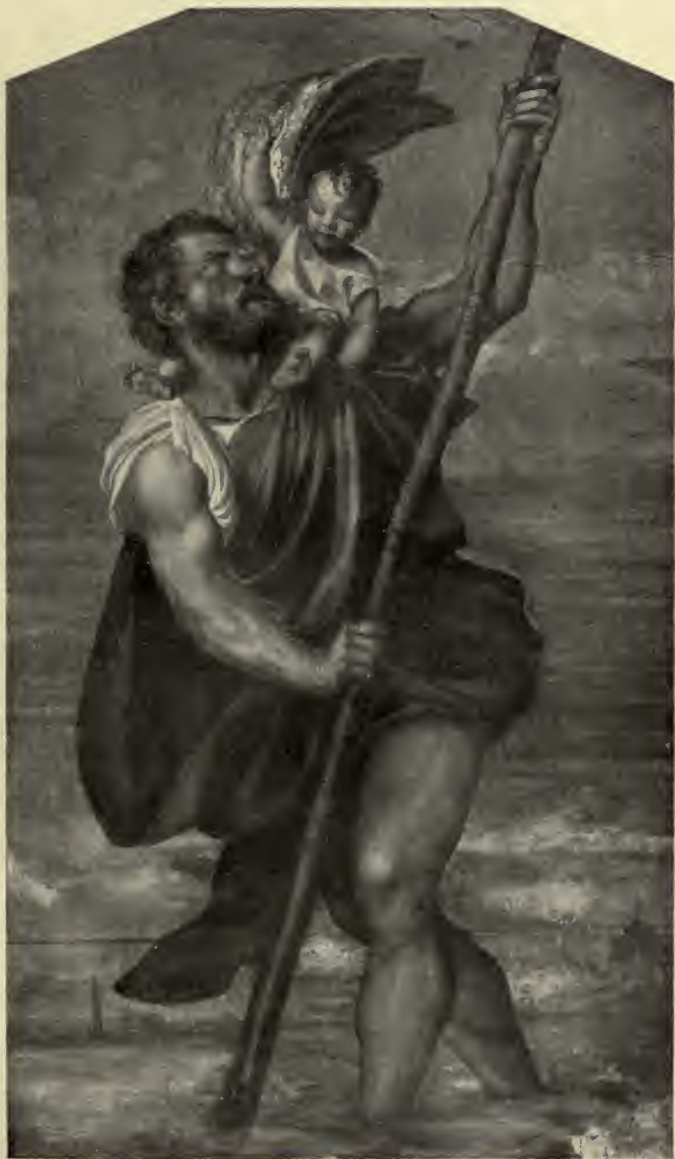
S. CHRISTOPHER FROM THE FRESCO BY TITIAN In the Doges' Palace