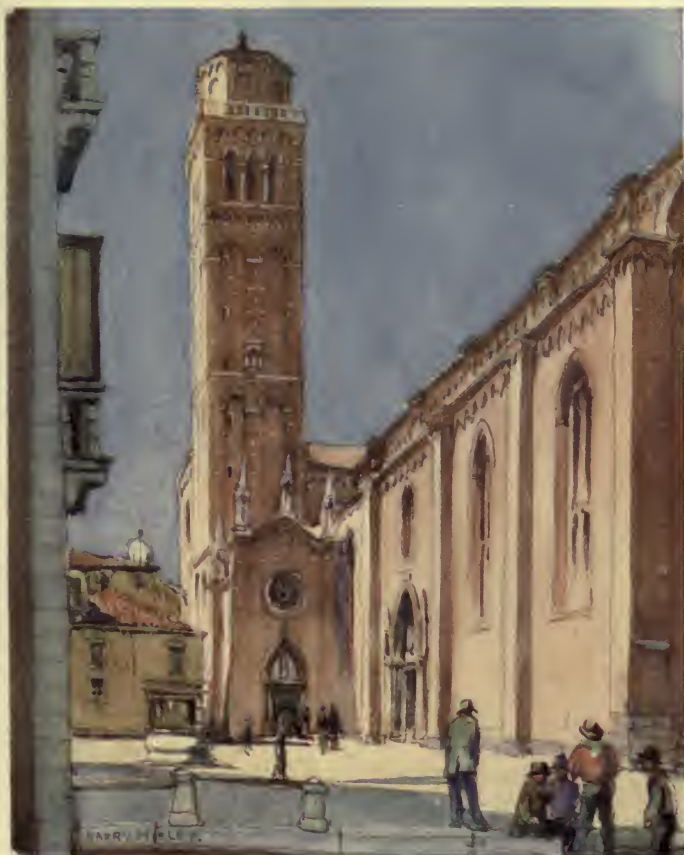
S. MARIA GLORIOSA DEI FRARI