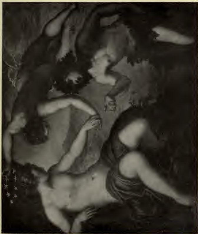
BACCHUS AND ARIADNE FROM THE PAINTING BY TINTORETTO In the Doges' Palace