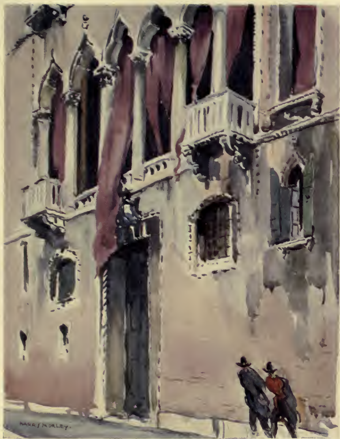
THE PALAZZO PESARO (ORFEI), CAMPO S. BENEDETTO