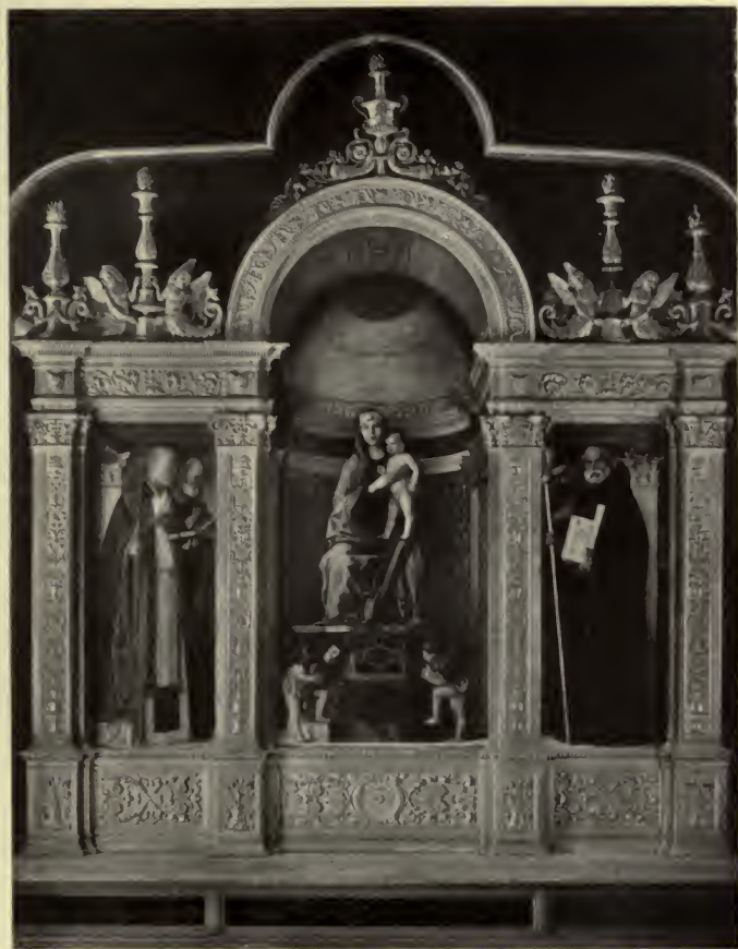
THE MADONNA TRIPTYCH BY GIOVANNI BELLINI In the Church of the Frari