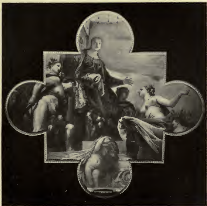
VENICE WITH HERCULES AND CERES FROM THE PAINTING BY VERONESE In the Accademia