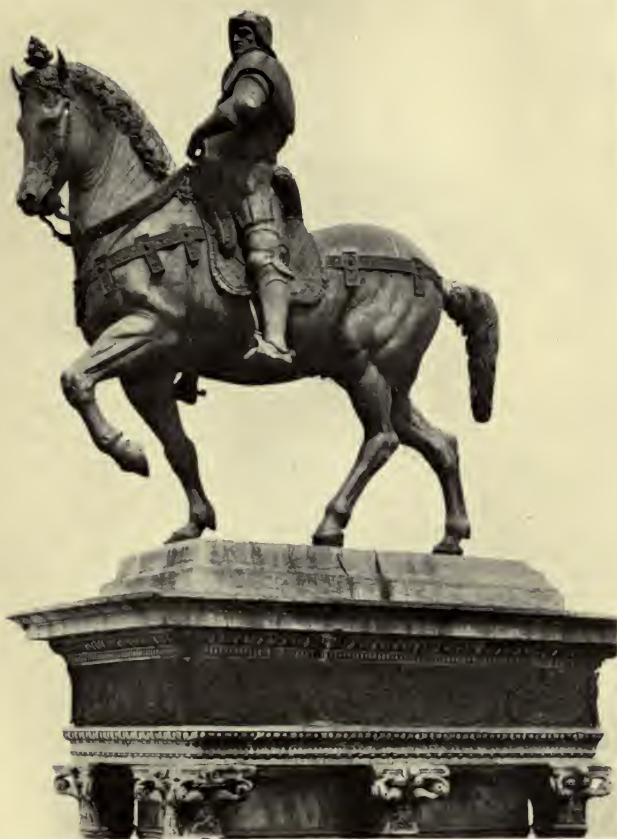
BARTOLOMMEO COLLEONI FROM THE STATUE BY ANDREA VERROCCHIO