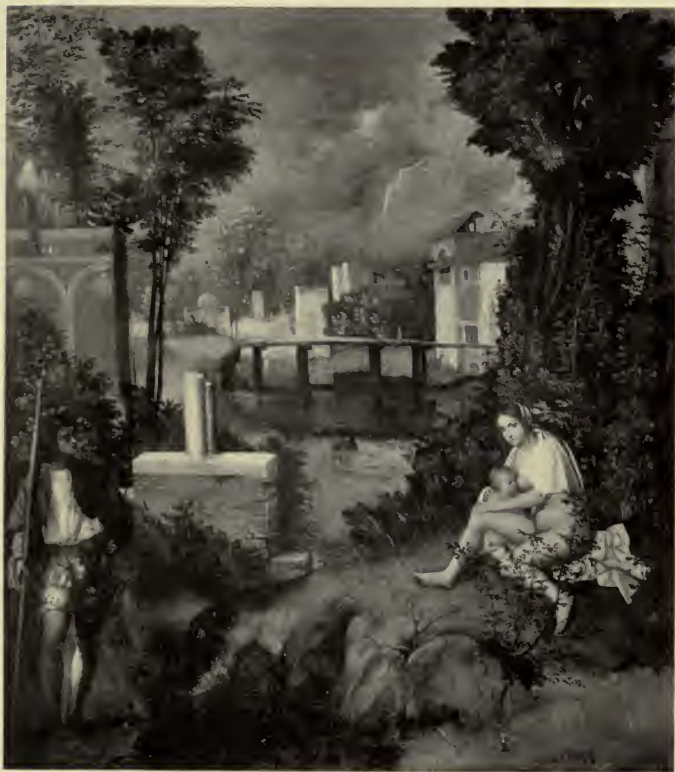
THE TEMPEST FROM THE PAINTING BY GIORGIONE In the Giovanelli Palace