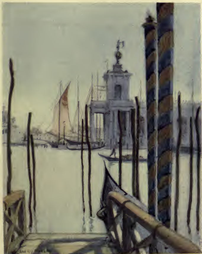
THE DOGANA (WITH S. GIORGIO MAGGIORE JUST VISIBLE)