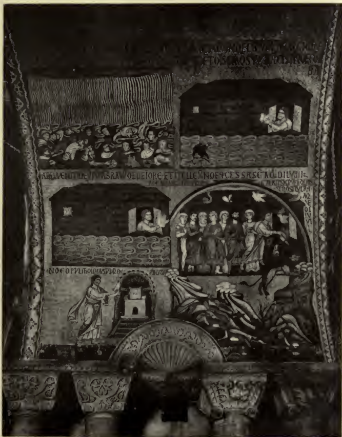
ONE OF THE NOAH MOSAICS In the Atrium of S. Mark's