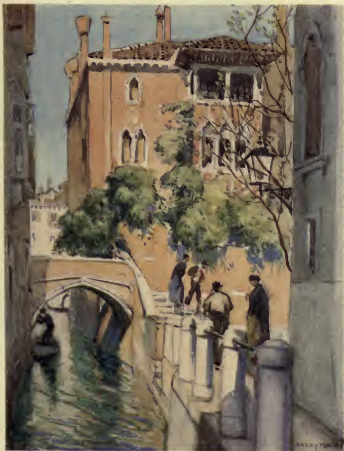
THE RIO TORRESELLE AND BACK OF THE PALAZZA DARIO