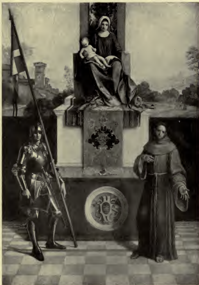
ALTAR-PIECE BY GIORGIONE At Castel Franco