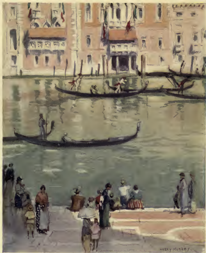
THE GRAND CANAL FROM THE STEPS OF S. MARIA DELLA SALUTE