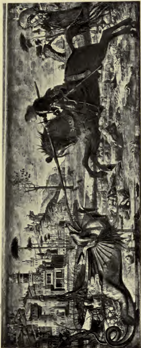
S. GEORGE AND THE DRAGON FROM THE PAINTING BY CARACCIOLO At S. Giorgio del Scliarconi