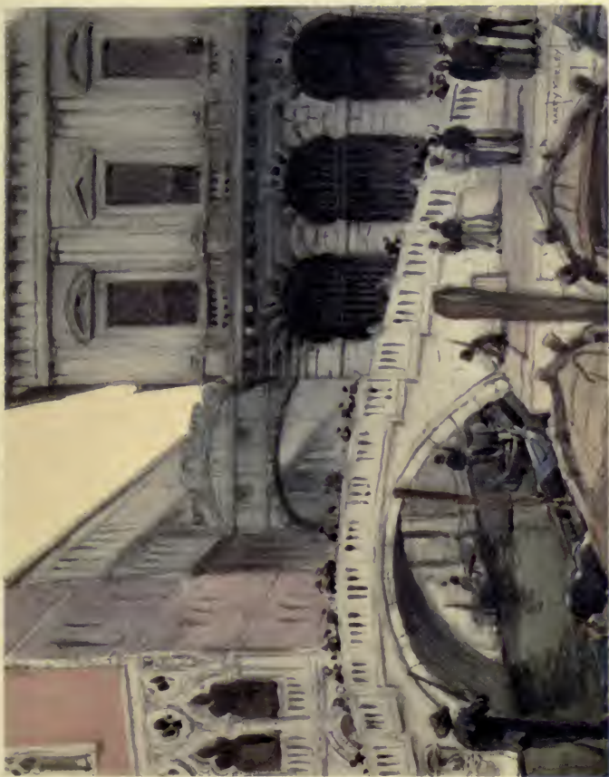
THE PONTE DI PAGLIA AND THE BRIDGE OF SIGHS, WITH A CORNER OF THE DOGES' PALACE AND THE PRISON