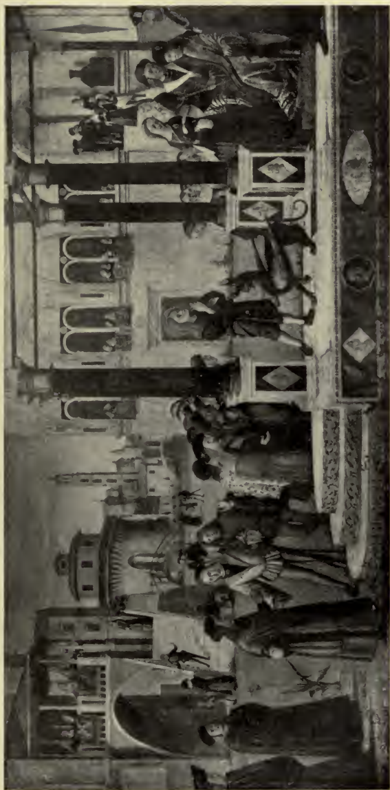
S. TRIFONIO AND THE BASILISK FROM THE PAINTING BY CARPACCIO At S. Giorgio dei Schiavoni