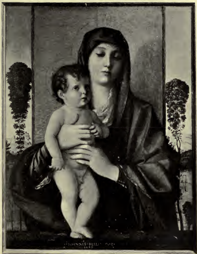
MADONNA AND CHILD FROM THE PAINTING BY GIOVANNI BELLINI In the Accademia