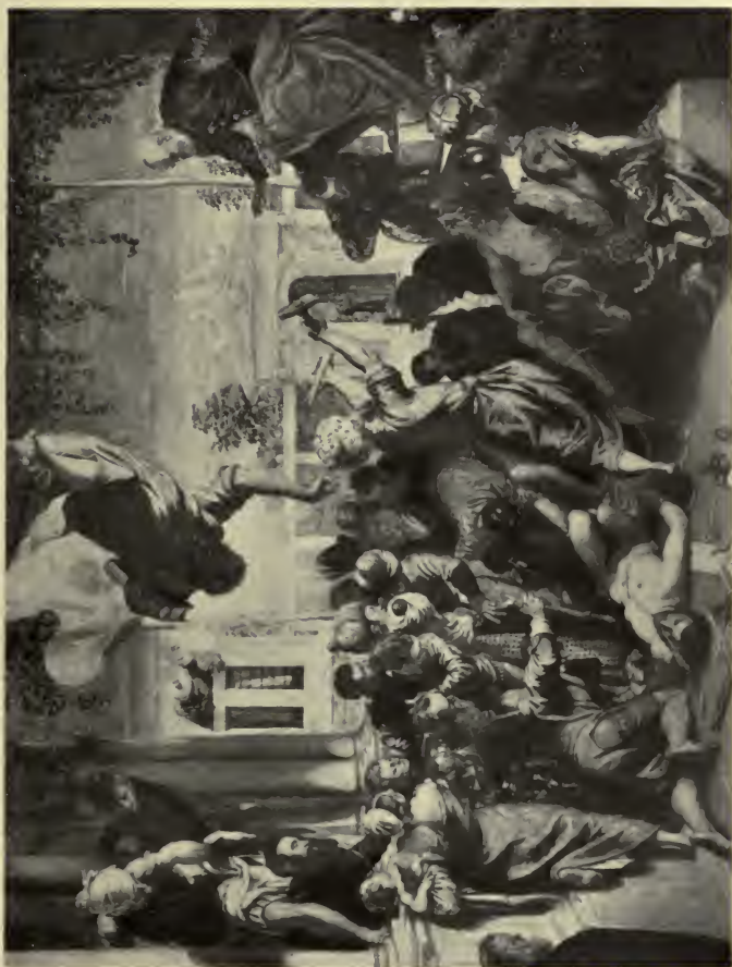
THE MIRACLE OF S. MARK FROM THE PAINTING BY TINTORETTO In the Accademia