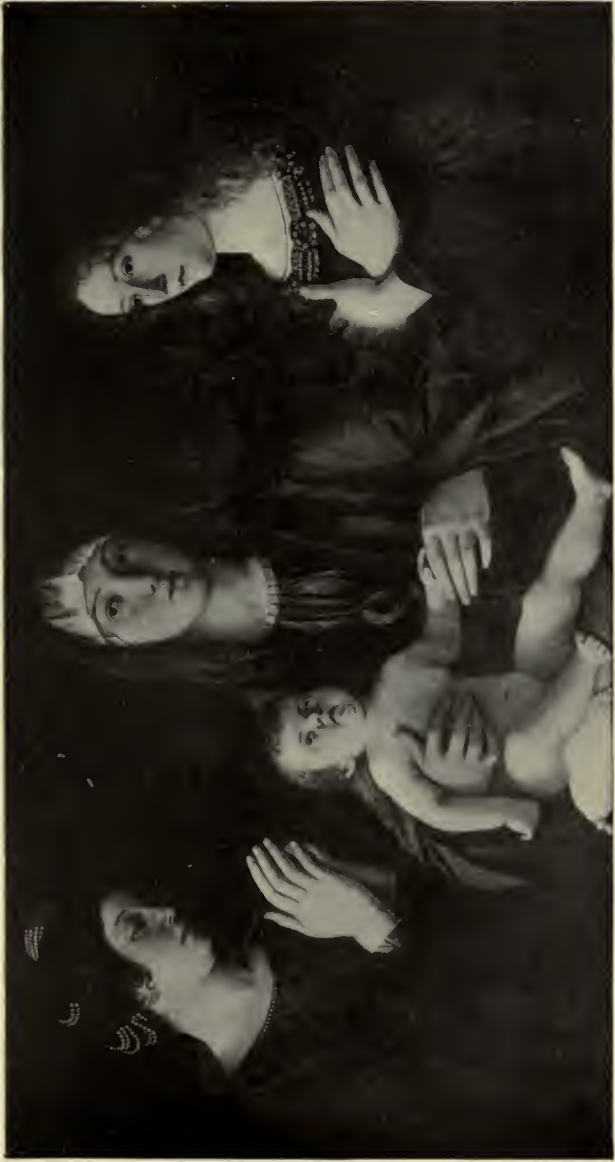
MADONNA WITH THE MAGDALEN AND S. CATHERINE