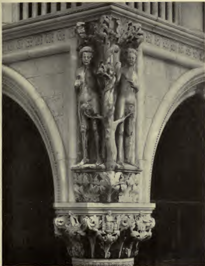
THE ADAM AND EVE CORNER OF THE DOGES' PALACE