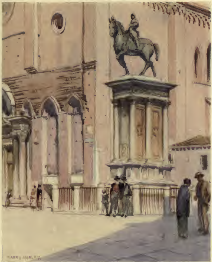
THE COLLEONI STATUE AND S.S. GIOVANNI E PAOLO