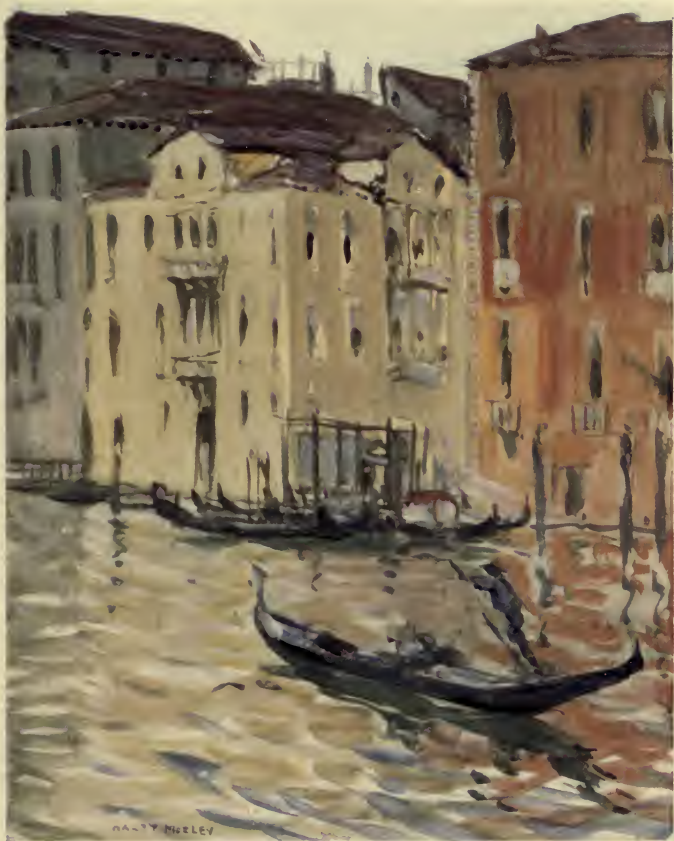
TRAGHETTO OF S. ZOBENIGO, GRAND CANAL.