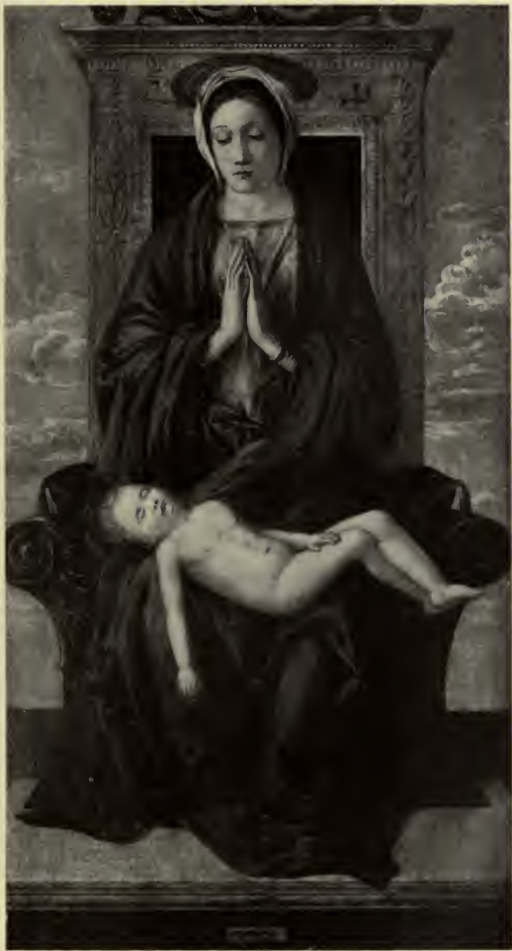
MADONNA AND SLEEPING CHILD FROM THE PAINTING BY GIOVANNI BELLINI In the Accademia