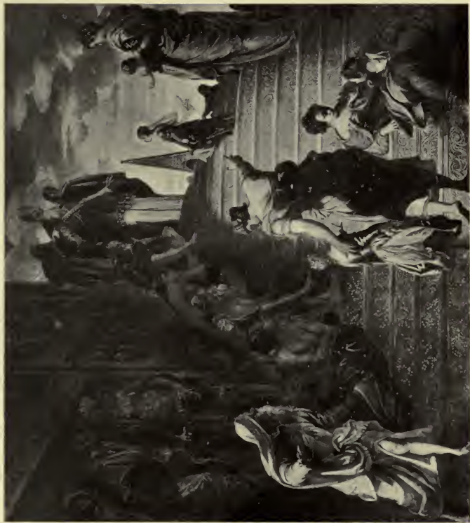
THE PRESENTATION FROM THE PAINTING BY TINTORETTO In the Church of the Madonna dell' Orto