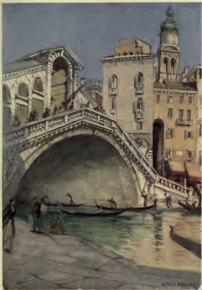
THE RIALTO BRIDGE FROM THE PALAZZO DEI DIECI SAVII