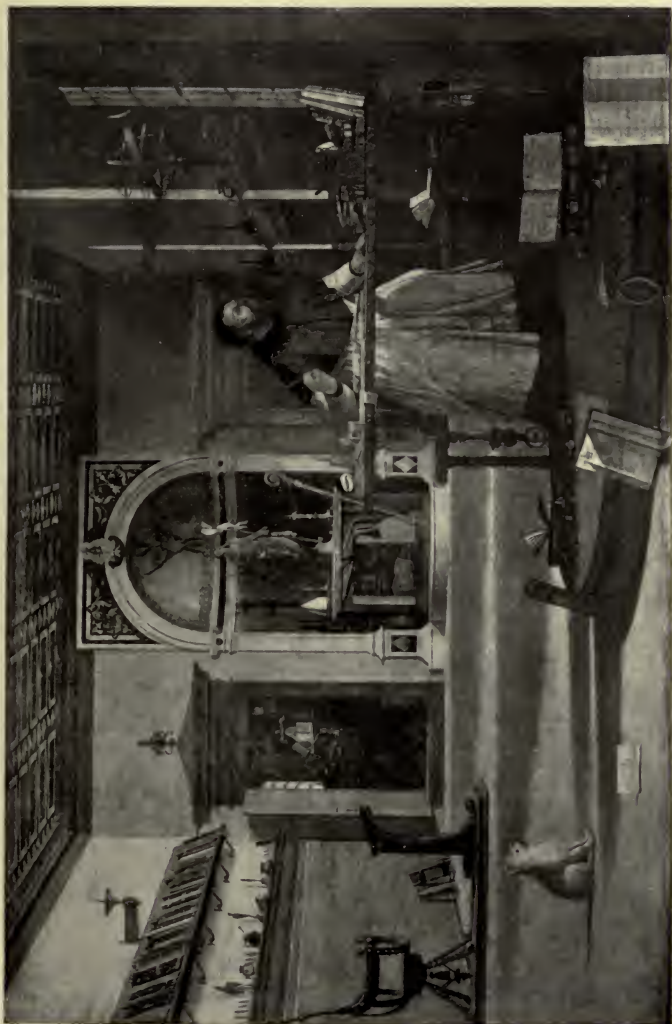
S. JEROME IN HIS CELL FROM THE PAINTING BY CARPACCIO At S. Giorgio dei Schiavoni