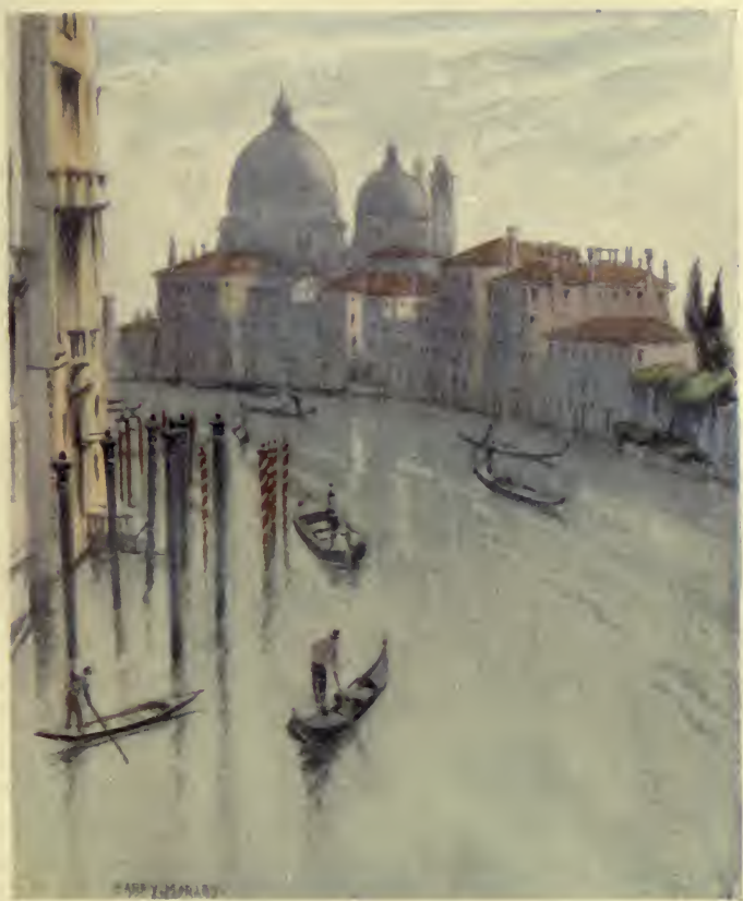
THE GRAND CANAL, SHOWING S. MARIA DELLA SALUTE