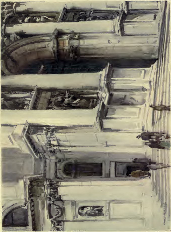
DOORWAY OF S. MARIA DELLA SALUTE