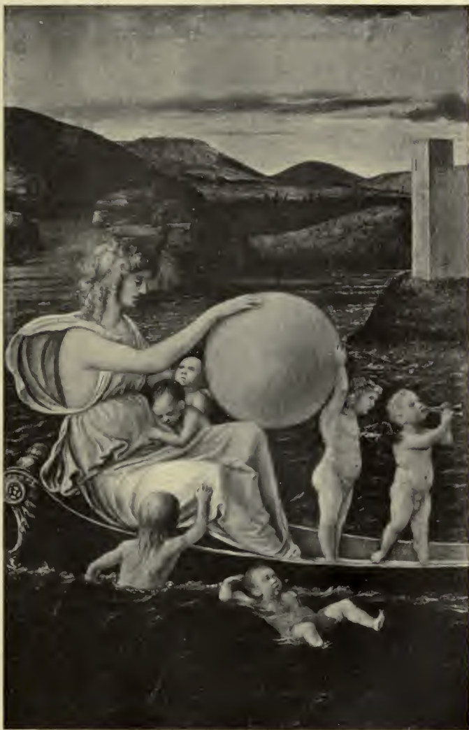
VENUS, RULER OF THE WORLD FROM THE PAINTING BY GIOVANNI BELLINI In the Accademia