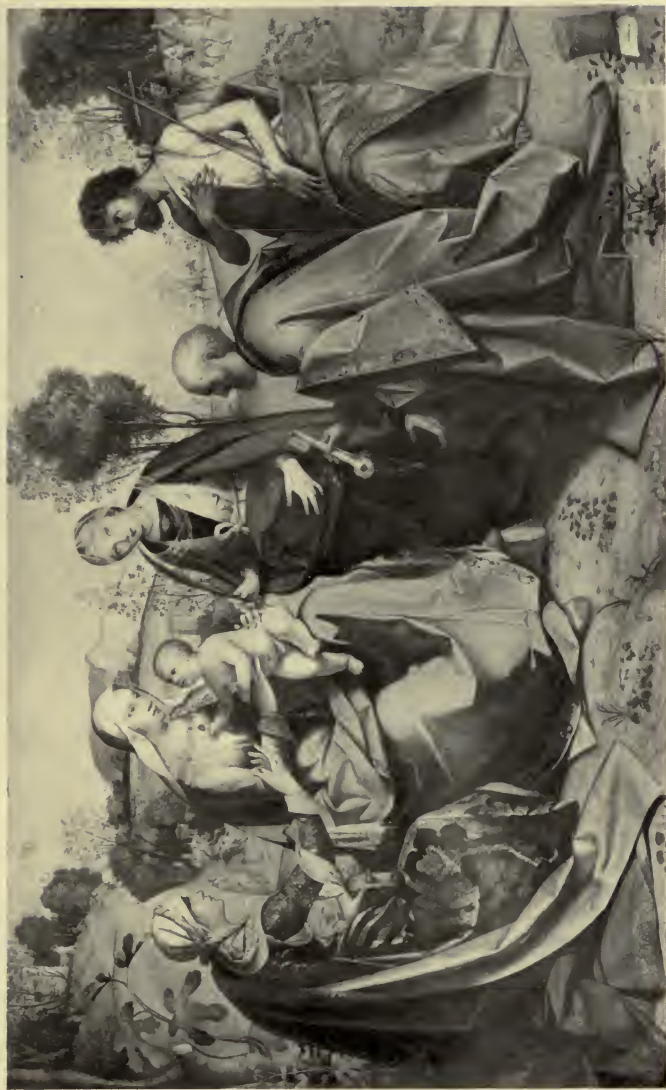
MADONNA AND SAINTS FROM THE PAINTING BY BOCCACCINO In the Accademia