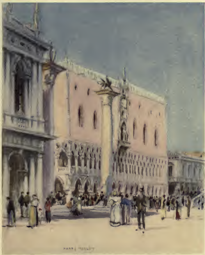
THE CORNER OF THE OLD LIBRARY AND THE DOGES' PALACE