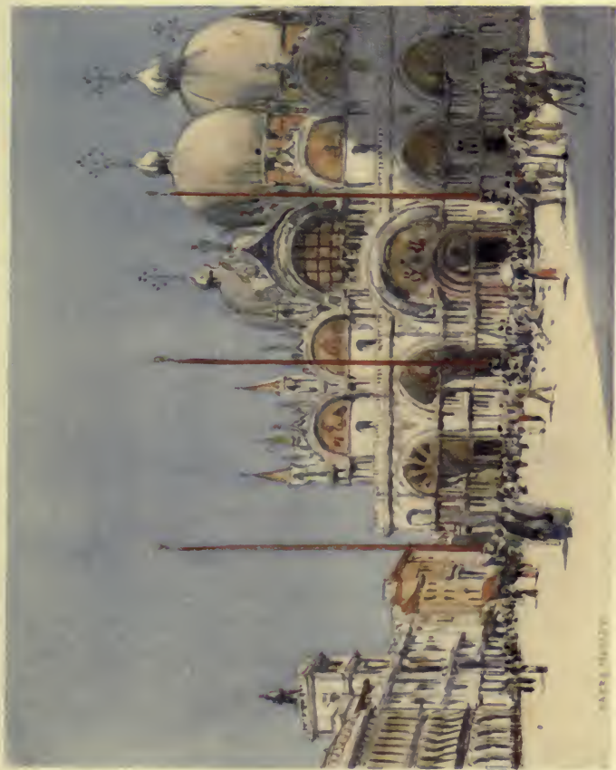
S. MARK'S FROM THE PIAZZA. THE MERCERIA CLOCK ON THE LEFT