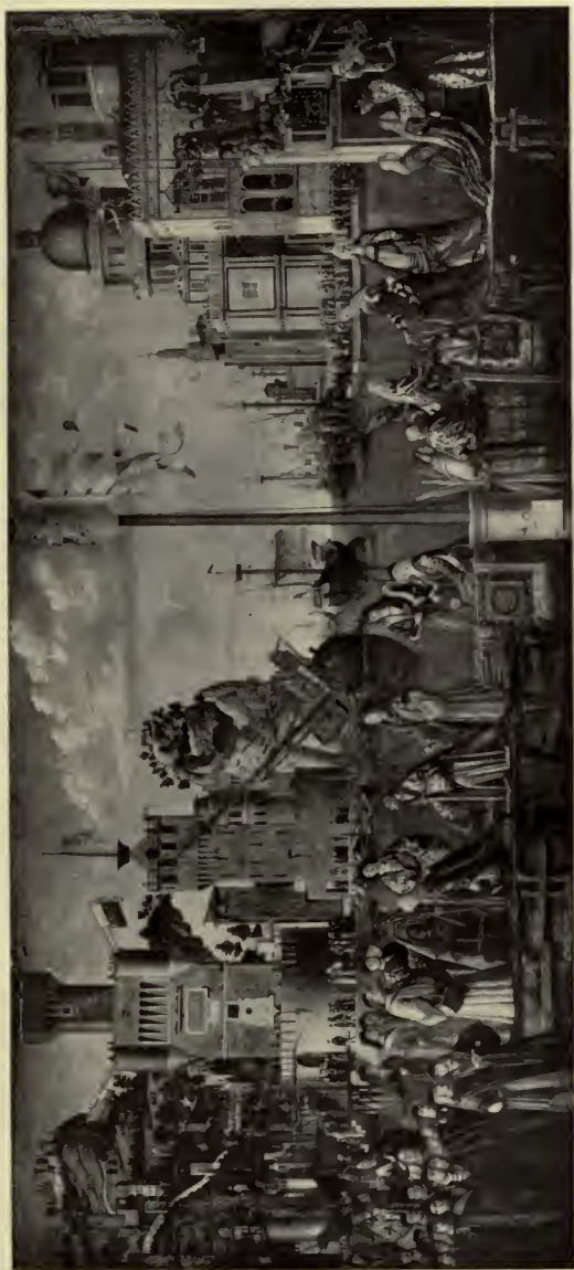
THE DEPARTURE OF THE BRIDEGROOM AND HIS MEETING WITH URSULA FROM THE PAINTING BY CARPACCIO In the Accademia