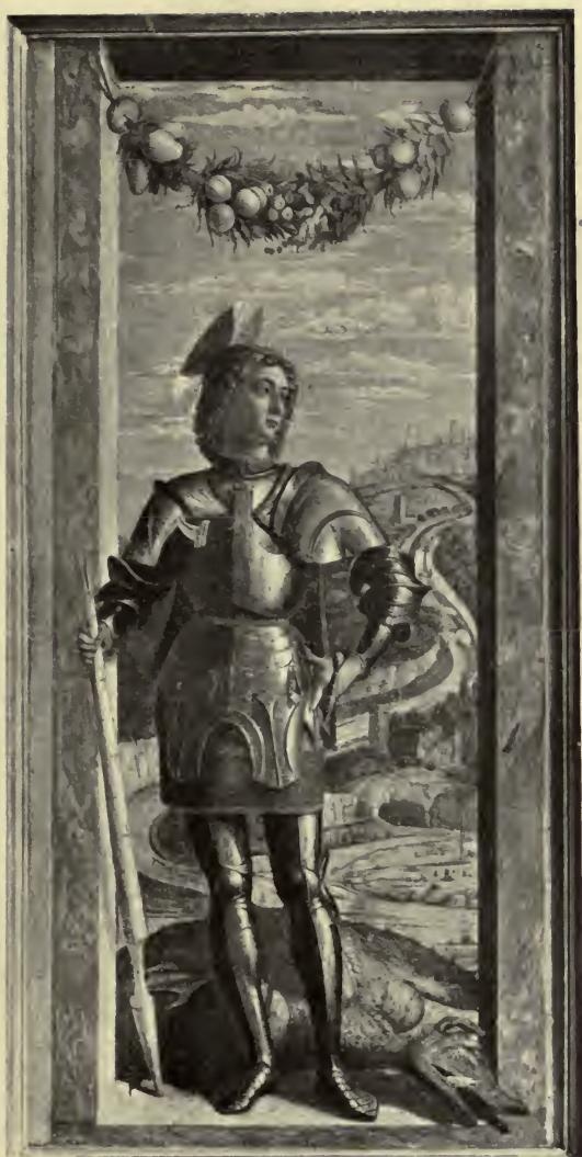
S. GEORGE FROM THE PAINTING BY MANTEGNA In the Accademia