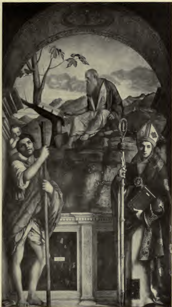
S. CHRISTOPHER, S. JEROME AND S. AUGUSTINE FROM THE PAINTING BY GIOVANNI BELLINI In the Church of S. Giov. Crisostomo