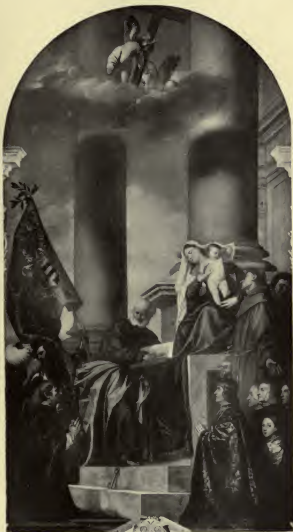
THE MADONNA OF THE PESARO FAMILY FROM THE PAINTING BY TITIAN In the Church of the Frari