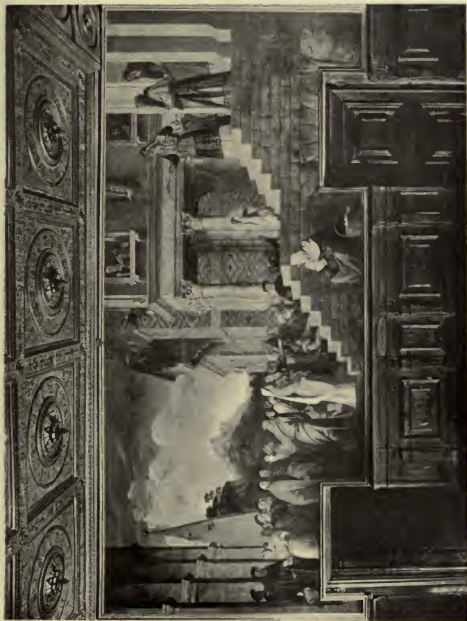
THE PRESENTATION FROM THE PAINTING BY TITIAN In the Accademia