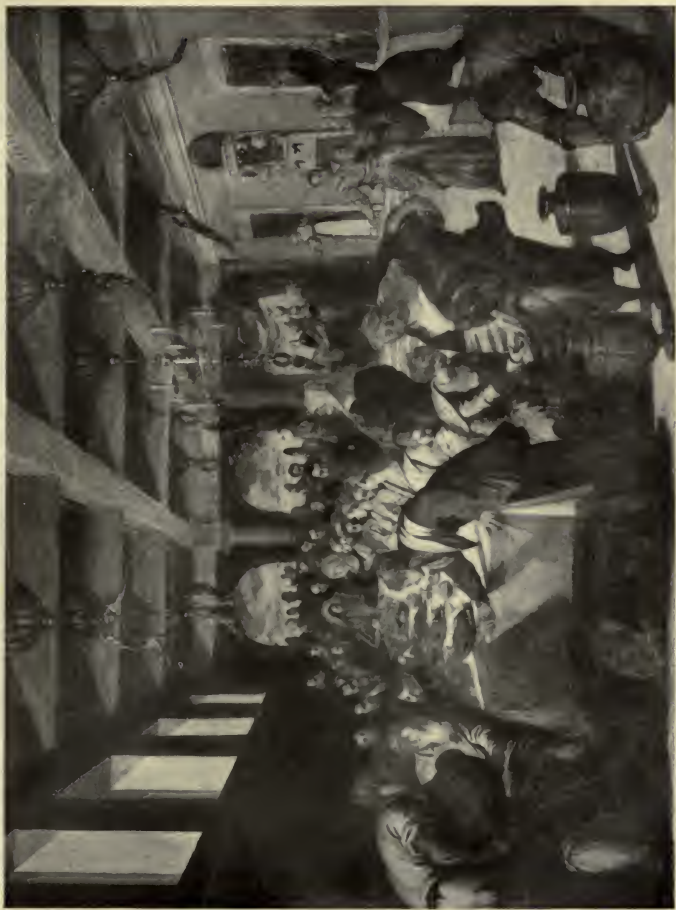
THE MARRIAGE AT CANA FROM THE PAINTING BY TINTORETTO In the Church of the Salute