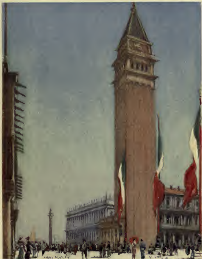
THE CAMPANILE AND THE PIAZZA FROM COOK'S CORNER