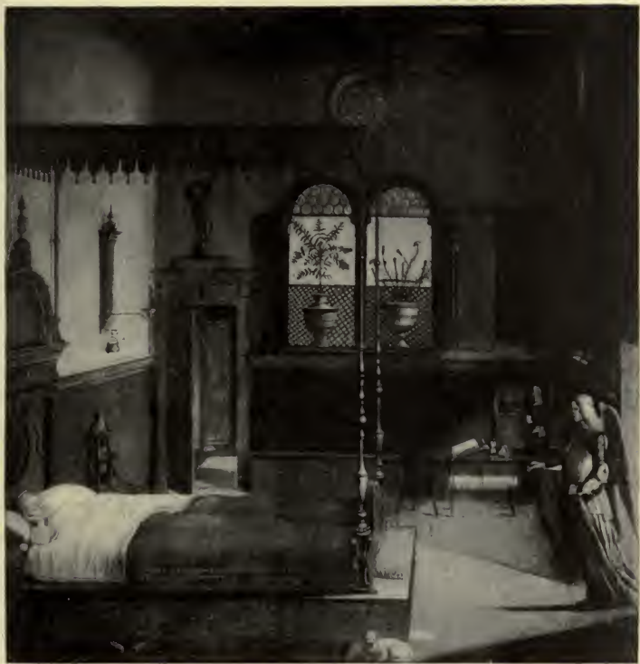
THE DREAM OF S. URSULA FROM THE PAINTING BY CARPACCIO In the Accademia